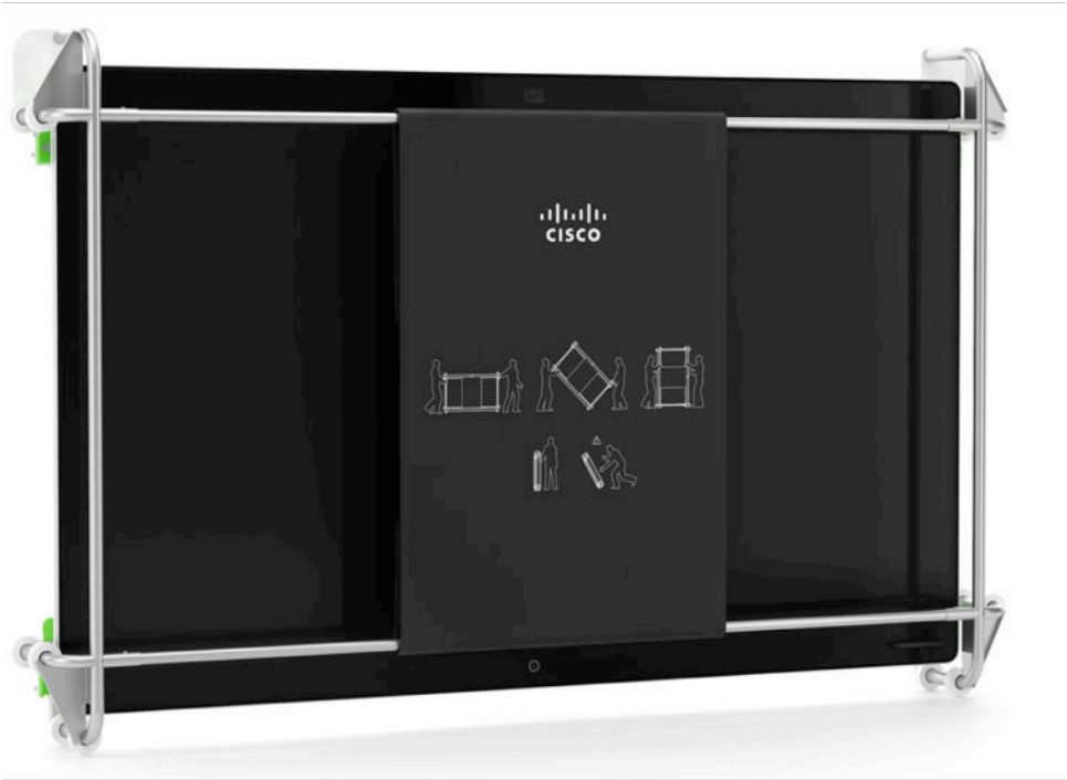
Figure 2. Webex Board 85 in new wheel-based packaging and transport frame