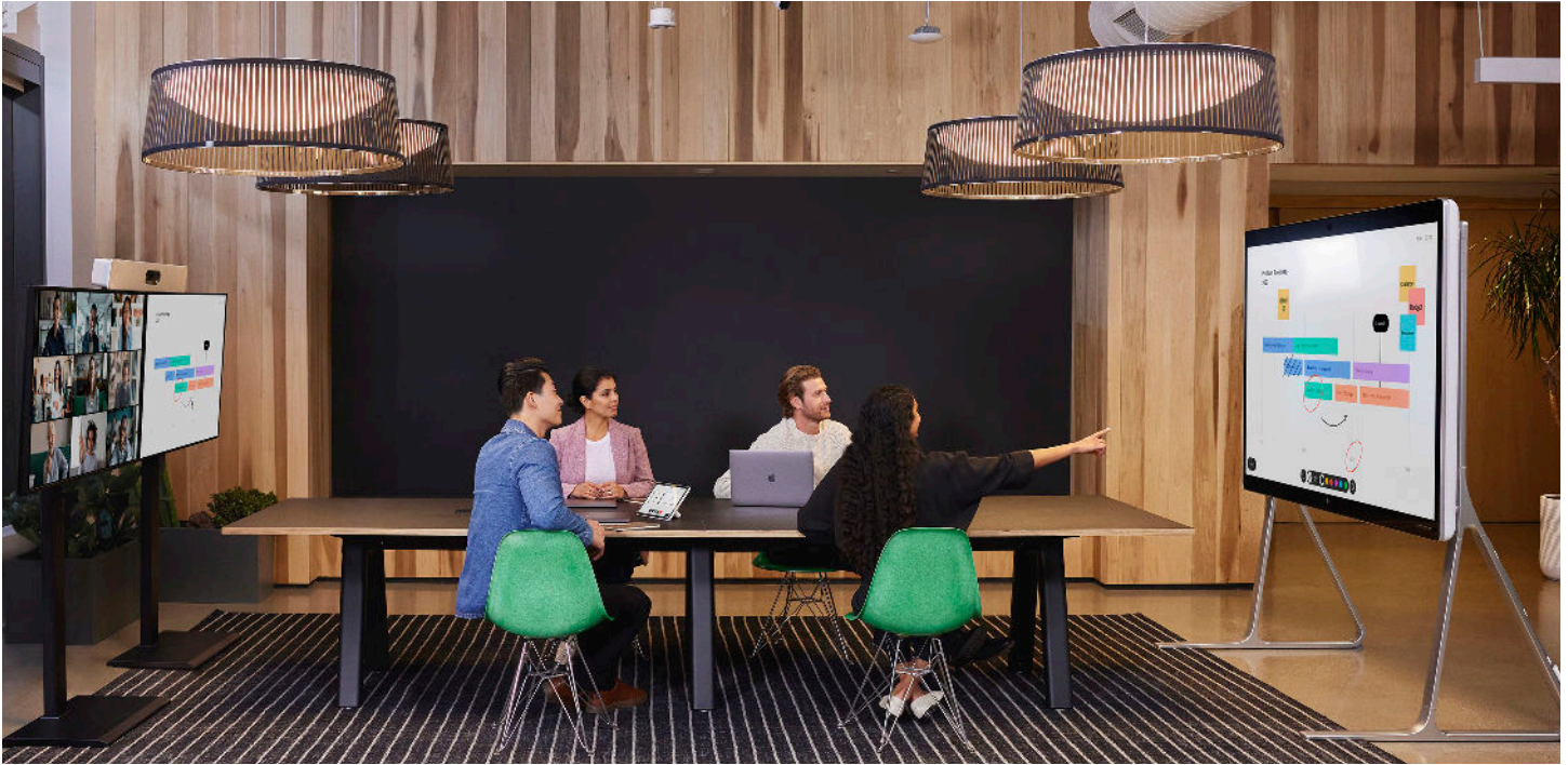
Figure 1. Webex Board 85 used for visual collaboration in a multi-screen environment