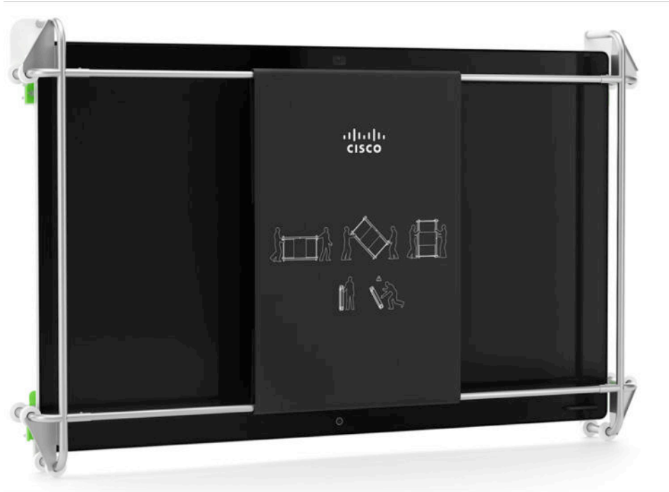
Figure 2. Webex Board 85 in new wheel-based packaging and transport frame