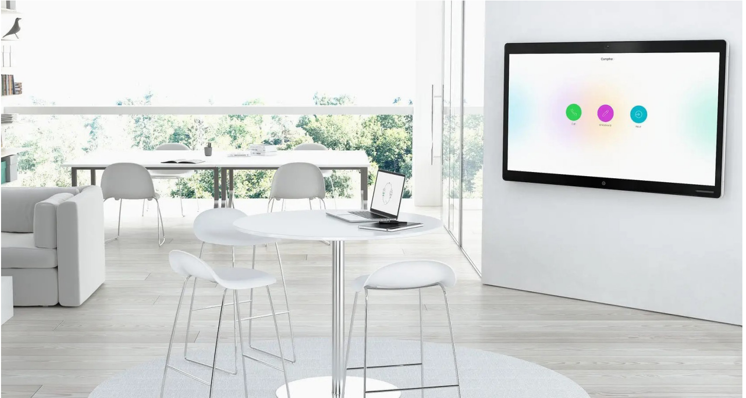
Figure 2. Wall-mount model of the Webex Board 70