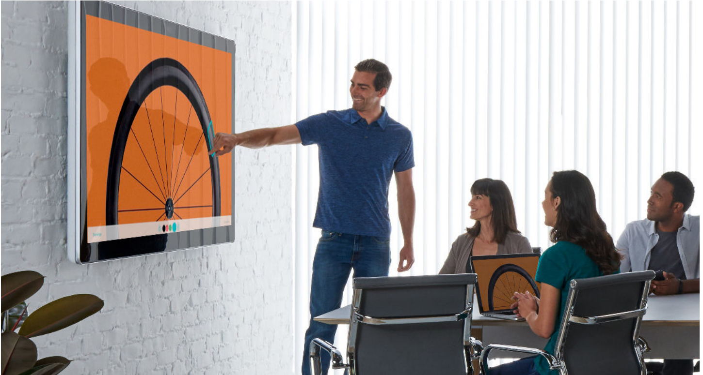
Figure 1. Wall-mount model of the Webex Board 70